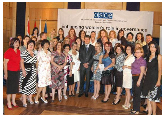
President of the Republic, Mr. Bamir Topi deliver certificates to the program participants