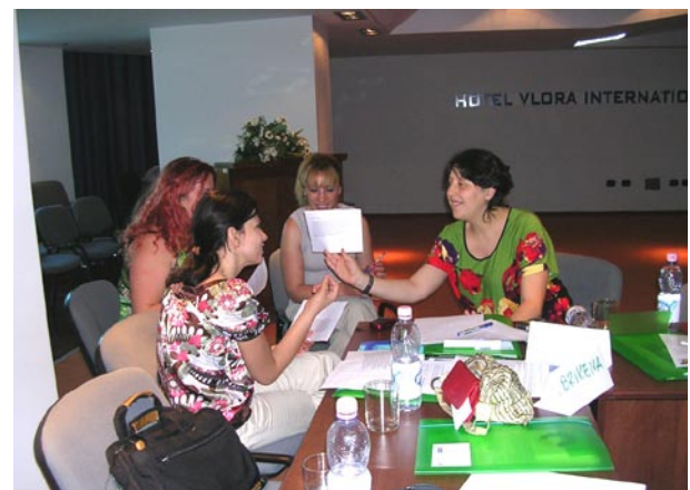
Participants in the program drafting their strategies of the work in public